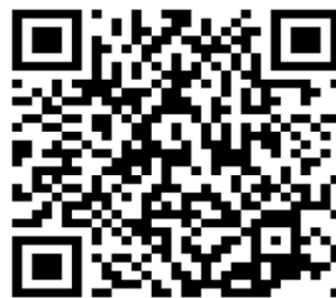
Picture 2. QR Code of the Teaching Material Product

At the end of this stage, the researcher evaluated the product after the trials. Based on the consistently high ratings from all test phases, the researcher deemed no further revisions necessary during the Implementation stage. The developed teaching material can be accessed through the following QR code: